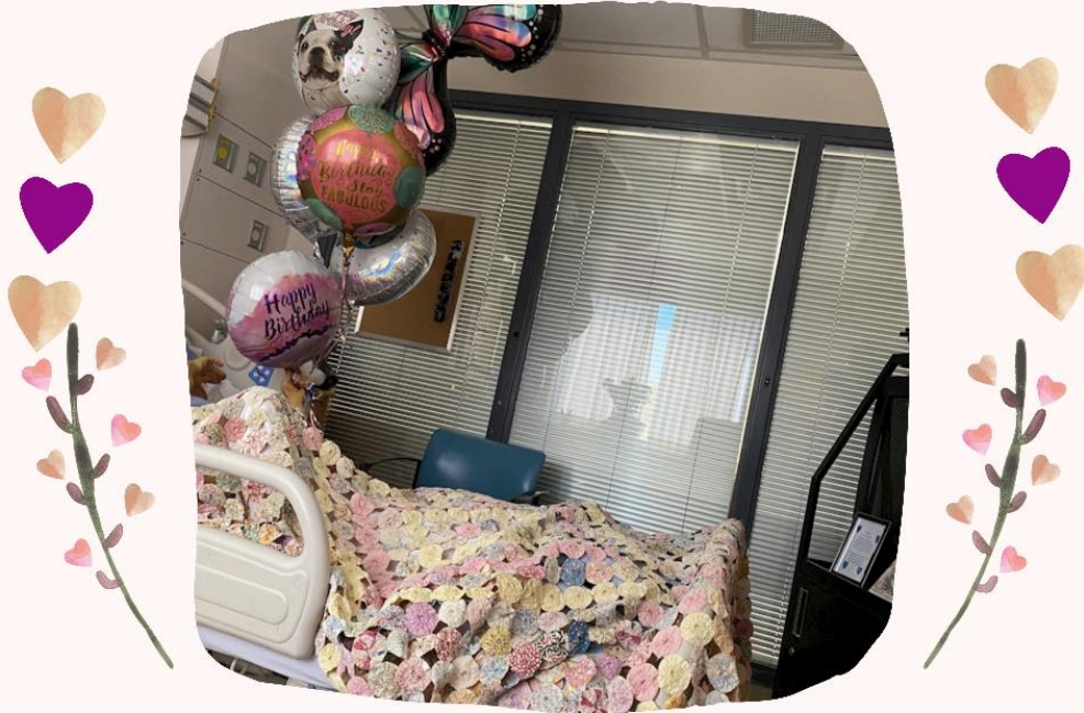
A very grateful senior got a beautiful donated blanket from us for her special Canada Day Birthday!